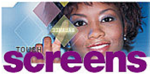
17.1"3M Capacitive CTII Touch Screen