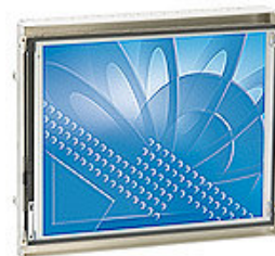
AIT 72VX Open Frame TM