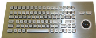
High end and Durable Industrial Key Board Solution with Trackball Water and Moisture Resistant