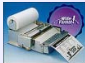
A4 Thermal Printer Option