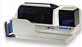
Card Printer Option